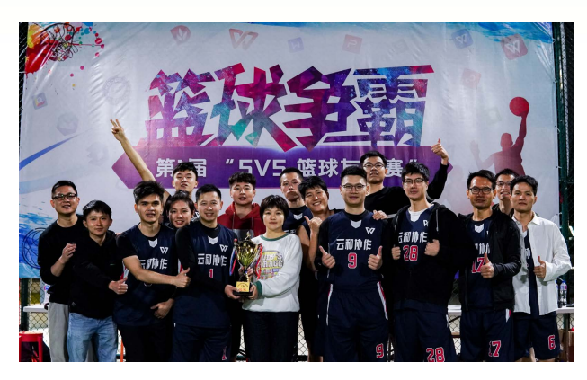
Basketball League Match

In 2021, the Company carried out a hiking activity named "Travel with Kingsoft Spirit", which aimed to drive employees to develop strong bodies, enhance our team cohesiveness and build our corporate culture. Subsidiaries conducted diversified sport activities such as shining run, basketball league match, hiking and biking, and provided a variety of interesting rewards to enhance employees' sense of happiness and fulfilment.