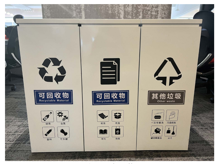
Separate trash cans for office areas

We actively promote low-carbon behaviours among employees, and encourage them to pursue a green lifestyle. We put up energy-saving slogans around workplace, advocating for the energy-efficient use of electric equipment such as lamps, air conditioners and computers. We use direct drinking water in a unified manner and avoid purchasing barrelled water to call on our employees to engage in environmental protection behaviours. Moreover, we post publicity materials related to paper-saving in the printing area and encourage employees to adopt double-sided printing. We place waste sorting trash cans in office areas in a unified manner to promote the knowledge of garbage sorting among employees.