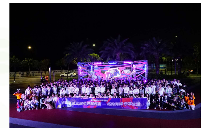
Seasun Shining Run