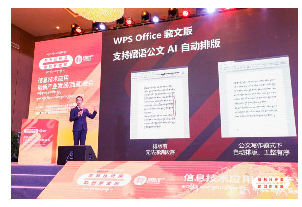
Kingsoft Office officially launches Tibetan version of WPS Office at the summit

We continuously provide products and services to facilitate the information-based digital and intelligent development of minority regions and promote balanced cultural development. In 2021, Kingsoft Office released the first domestically produced Tibetan office software WPS Office in China, and provided a free lifetime license of professional edition of WPS Office for the educational systems across Milin County, Tibet Autonomous Region. Moreover, Kingsoft Office, together with Tibet University, set up the "Language Technology Development Laboratory", accelerating the digitalisation and informatisation of minority areas, facilitating relevant industry development of minority areas as well as promoting the diversity and vitality of the community of shared culture for Chinese nation.