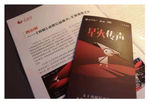
Free public welfare game "Biphase" produced by Seasun

We develop products taking into account mental health to promote an appropriate perception of mental health among users. In March 2021, Seasun Holdings launched its first free public welfare game, namely Biphase. Biphase depicts individual experiences and emotional dilemmas of patients with bipolar disorder, which, on the one hand, leads players to experience the real life of patients with bipolar disorder in the game, on the other hand, raises social understanding of and concern for such patients outside the game through its good reputation. Biphase has not only been certified by DBSA (Depression and Bipolar Support Alliance), an international public welfare organiation, but also reported by Pocket Gamer, Gamasutra, Game Press and other media in more than ten languages. Biphase won two awards in China Game Developers Awards (CGDA) and was selected as an exemplar of public welfare by People's Daily Online.