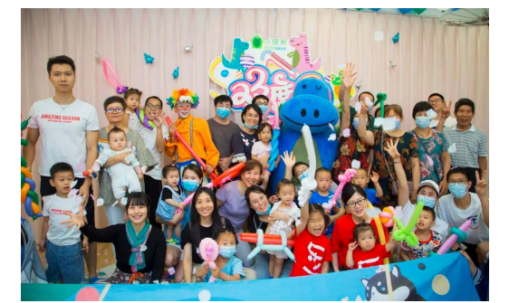
Children's Day Employee Family Day Theme Celebration