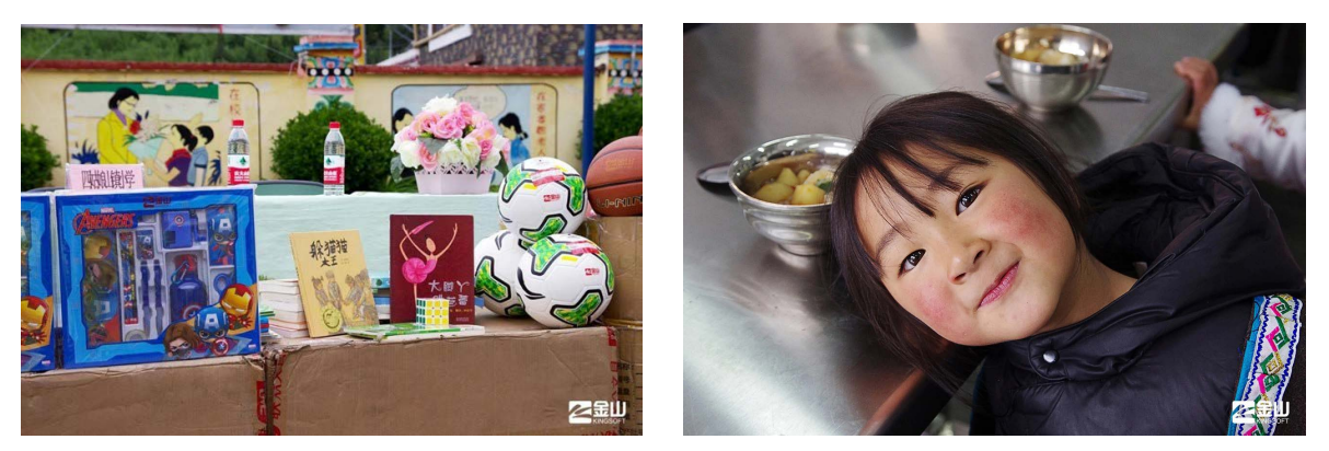
Group Donates to Kingsoft Hope Primary School

After the devastating earthquake hit Wenchuan in 2008, we have made donations for rebuilding Kingsoft Primary School (Central Primary School of Siguniangshan Town in Sichuan), and provided continuous assistance for thirteen years to create a comfortable learning environment for the children and promoted educational development in remote areas. In April 2021, to cultivate a culture of "Joyful Learning and Positive Growth" for the children in Kingsoft Primary School, we once again called on all employees to donate their idle books, school things and sports goods to the school. Furthermore, the staff gave an unique digital lesson to the children through intelligent home appliances such as Xiaomi AI speaker and Xiaomi desk lamp, making them experience the convenience and pleasure brought by science and technology.