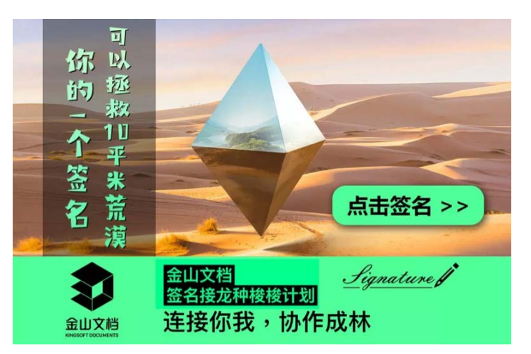
Kingsoft Office organised an activity named "Signatures for Haloxylon Ammodendron Planting"

We encourage users to participate in environmental protection activities based on products. Kingsoft Office organises an activity named "Signatures for Haloxylon Ammodendron Planting", calling on users of Kingsoft Document to participate in the online signature activity. A total of 10,000 haloxylon ammodendron are donated to the Society of Entrepreneurs and Ecology (SEE), which facilitates desertification controlling in the Alxa region and increases more "green trees" to the earth.