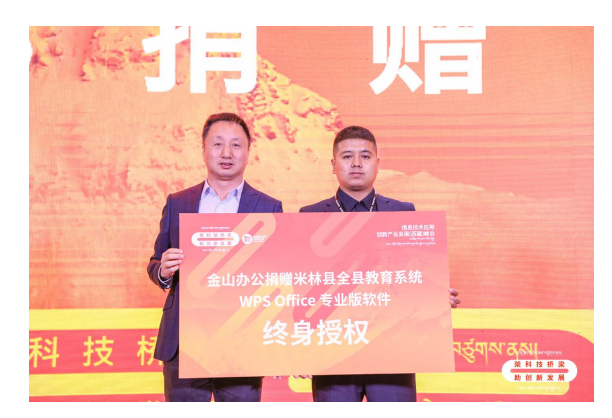
Kingsoft Office Donates WPS Office Professional Software to Milin County Education System