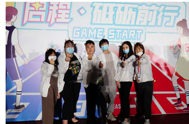
Seasun Hiking Activity